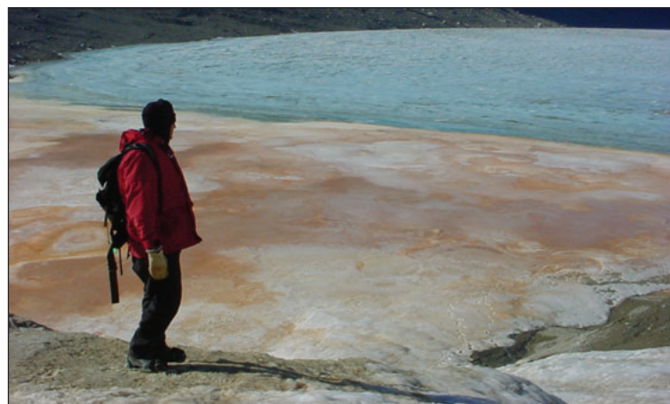
Figure 3. A sulfur-oxidizing, iron-reducing bacterial consortium leaves a characteristic rust-colored stain in outflow waters of an Antarctic glacier.

Connections between the biogeochemical cycles also derive from intrinsic properties of organic compounds, which can often capture certain elements from the environment, changing their solubility in water to higher or lower levels that leave a biotic signature on the planet. In northern latitudes, the profile characteristics of regional soils (spodosols) derive from the chelation of Fe in fulvic