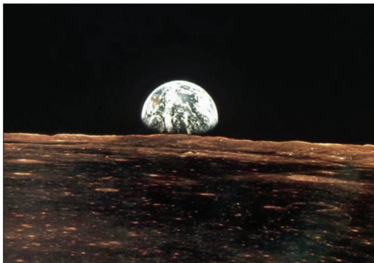
Figure 1. Earth as seen from the Moon, showing the circulation of the atmosphere that links the biogeochemical cycles of land and sea.

as nitrate \{NO_3^-\} coupled to oxidation of organic materials) in wet sediments. As a discipline, biogeochemistry recognizes that there is no pure geochemistry at Earth's surface; everywhere, life has left its imprint on the chemistry of the planet.