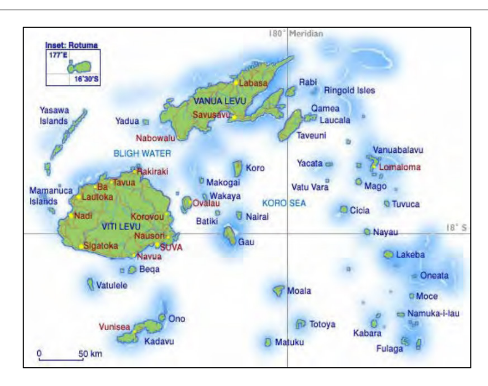
Figure 1 : Map of Fiji islands

In the past few years, Fiji has continuously raised awareness to regional and global audiences on climate emergencies in Fiji and the Pacific region. Fiji's active role in the recognition of urgent coordinated actions needed to combat issues related to climate change has resulted in the implementation of national climate change policies, initiatives and acts. This in itself indicates the lack of responsiveness to discussions of climate policy in the country in the past few years. Recently, on 23rd September 2021, Fiji's parliament enacted the Climate Change Act 2021 (CCA) and published it in the Government of Fiji Gazette (2021) on the 24th of September. The primary purpose of CCA 2021 is to implement at the national level Fiji's commitments and obligations to reduce its GHG emissions along with other climate change objectives (CCA, 2021). Sloan (2021) highlighted some of the fundamental objectives of the CCA 2021, which include: to reduce the production of greenhouse gases and accurately measure that reduction in accordance with international law standards; to boost Fiji's efforts at carbon sequestration meaning the removal and storage of carbon in its natural environment; to respond and adapt to the destructive effects of climate change; to improve the health and security of Fiji's oceans for a number of reasons