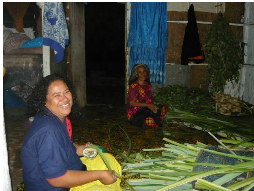
Figure 3: SHS lighting for income generation: an example from Tonga