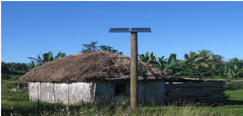
Figure 2: A typical Solar Home System in rural Fiji

A 2012 study (Urmee and Harries, 2012) surveyed one hundred and five SHS using households in Fiji and found that 84% of the respondents had an increase in their quality of life. They did not report any significant income-generation activities emanating from this initiative. However, a similar study conducted in Bangladesh (Urmee and Harries,2011) reported that SHS can be used productively to create extra income. Some of the driving factors for a successful SHS programme were identified as systems designed to fulfil user's needs and a sense of ownership.