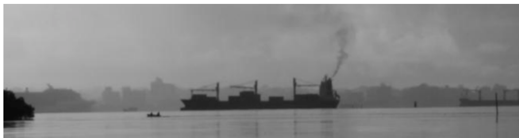
Figure 2: Container ship entering Suva Port

Prosecution of global-scale mitigation measures currently in train under IMO leadership, while promising to have a favourable impact on the global industry's emission profile, is likely to lead to increased costs and barriers in Oceania, whose contribution to the global emissions is so minute as to be irrelevant, resulting in a double penalty for no visible regional benefit (Nuttall, 2013). Pacific Islands cannot afford to lose much needed income in this way.