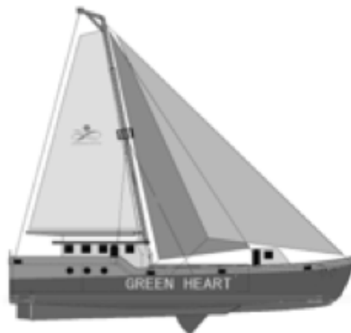
Figure 4: Greenheart Vessel

The intention, assuming funding is secured, is to trial renewable energy shipping technology and operation using different vessel types on up to three selected Fijian routes as part of the six-year research programme, with the trials progressing from forward planning, to controlled field research and ultimate transfer to community managers/owners. Two types of vessel design are anticipated as the initial focus: village-scale catamarans of between 4 and 10 dwt load-carrying capacity and small freighters capable of carrying between 60 and 100 tonne payloads. Both vessel types were identified as being the most appropriate in previous research during the 1980s and these findings have been mirrored in the more recent Fiji-situated research. Several designs exist and are the focus of current build experiments by our international partners. The small scale of such vessels means they can be maintained and, ultimately, built in Fiji.