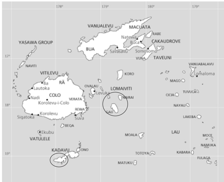
Figure 3: Map showing Fijian case study locations