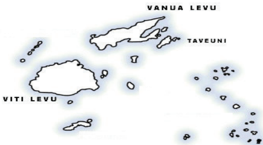
Figure 1. The survey sites for Graeffea crouanii in Fiji.

For this study only three bigger islands namely, Viti Levu, Vanua Levu and Taveuni were chosen (Fig. 1). The G. crouanii surveys were conducted on main coconut growing areas with reference to three climatic conditions (temperature, rainfall and humidity).