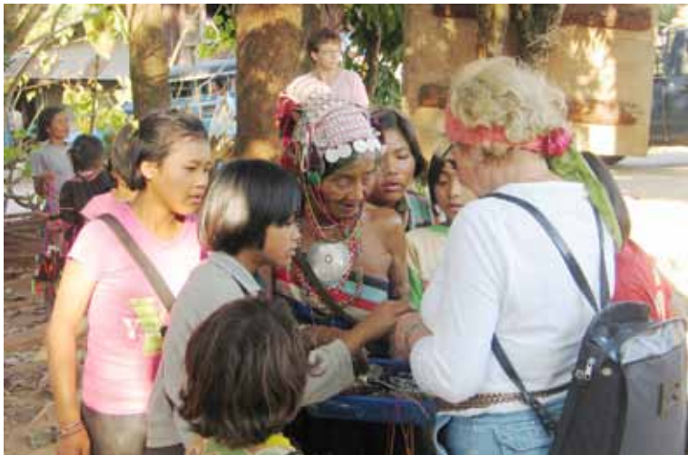
Photograph: A. TRUPP 2006.