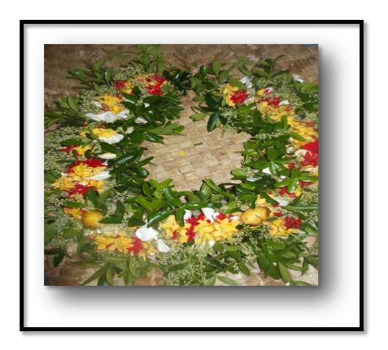
Figure 2: Salusalu Metaphor

Sauvi is derived from the word sau , which means being imbued with mana (Tuwere, 2002). It also means power, prosperity, effectiveness and sustainability that leads to wellbeing, which is achieved when people adhere to their social roles. Vanua Sauvi is the process of bringing mana effectiveness, power, richness and wealth back to a vanua (place). This is an indigenous Fijian concept of conserving resources through the use of traditional protocols; land and sea resource use are restricted to allow the vanua to restore its resources. A traditional ceremony is held to traditionally tabu (close or restrict) the use of resources from a specific given area for a specific time, and subsequently a traditional ceremony is held to open or un-hold the restriction. If anyone disobeys the restriction, the person will be ore (punished traditionally). Indigenous Fijians perceive vanua holistically; as noted earlier, it includes the physical, cultural and spiritual aspects of a place and their relationship to each other. Each aspect cannot exist without the others – they are interdependent. This study examines the practice of Vanua Sauvi as a conservation, food and human security strategy that contributes to sustainability and resilience.