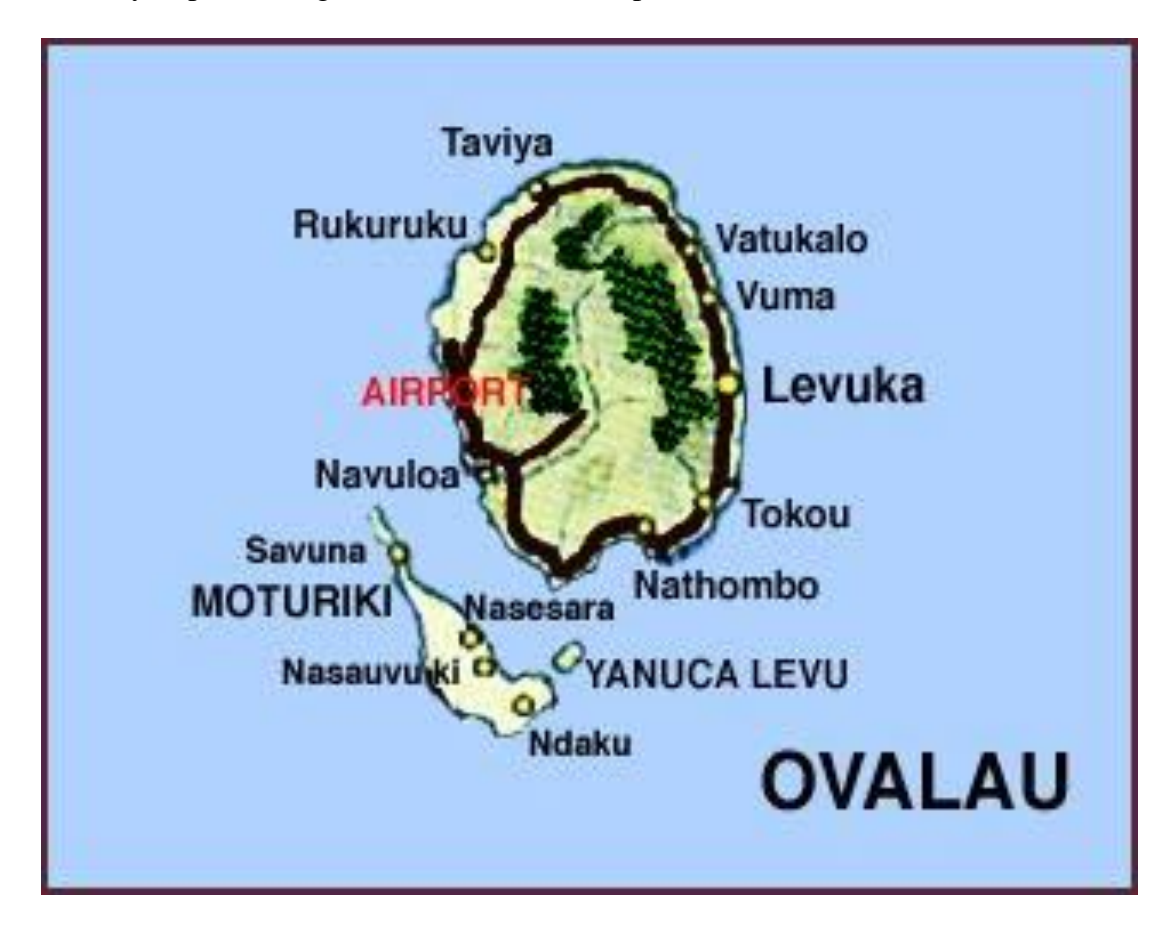
In 2011 a restriction on the use of land and sea resources at the eastern end of Rukuruku village was enforced. No one was allowed to cut trees, plant or use resources from the specified land and sea area. A traditional protocol was followed to ensure that all the members of the community were informed of the restriction and would respect it. Two poles woven with

The Vanua Sauvi approach is still practiced in some areas in Fiji. Rukuruku village on Ovalau is one of the places where this concept is practiced. Rukuruku is a village located on a bay on the eastern coast of Ovalau, Fiji. Its coastal location does not spare it from the impacts of climate change. The village is affected with sea level rise, causing coastal erosion and the depletion of land and sea resources. To ensure the maintenance and survival of the vanua, this village uses the village governance institutions as a way of governing and maintaining its resources by implementing the Vanua Sauvi concept.