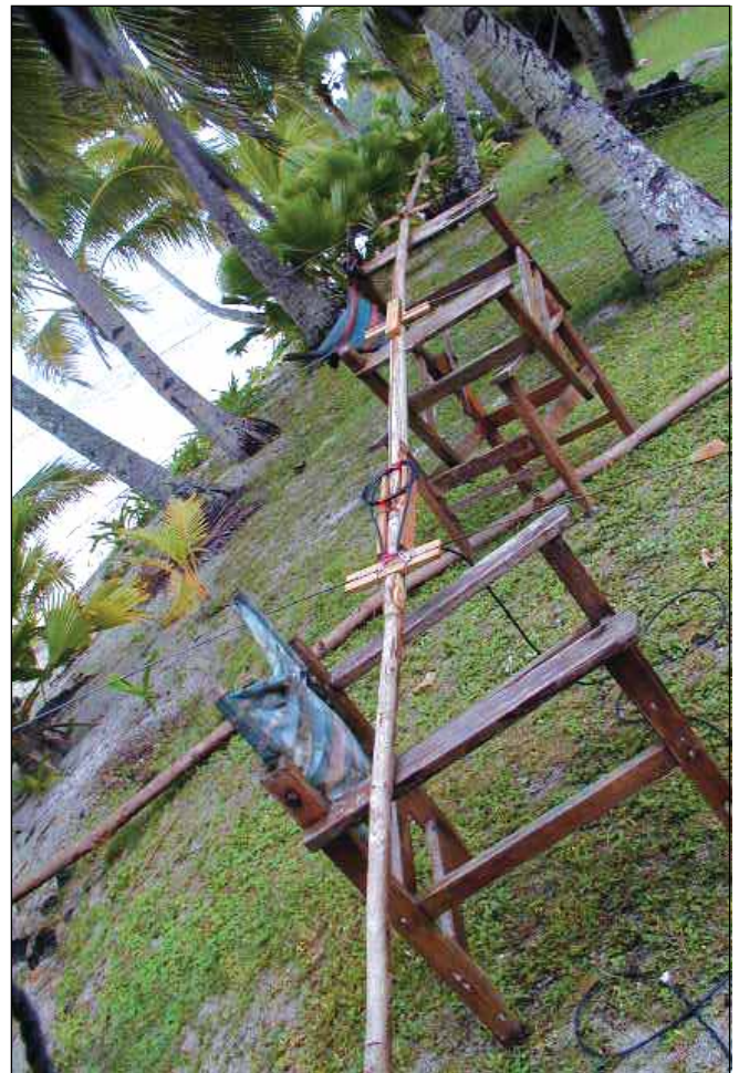
Fig. 3: Starting to build the Yagi on the old lounge chairs.

A compromise was found with some lengths of steel clothesline that were lying