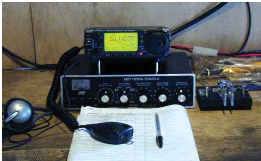
Fig. 1: The simple 3D2AG/P station consisting of IC-706, antenna tuner and a few ancillary items.

www.df5ai.net/ArticlesDL/ExternalRes/ZL3NEPropPredict.pdf