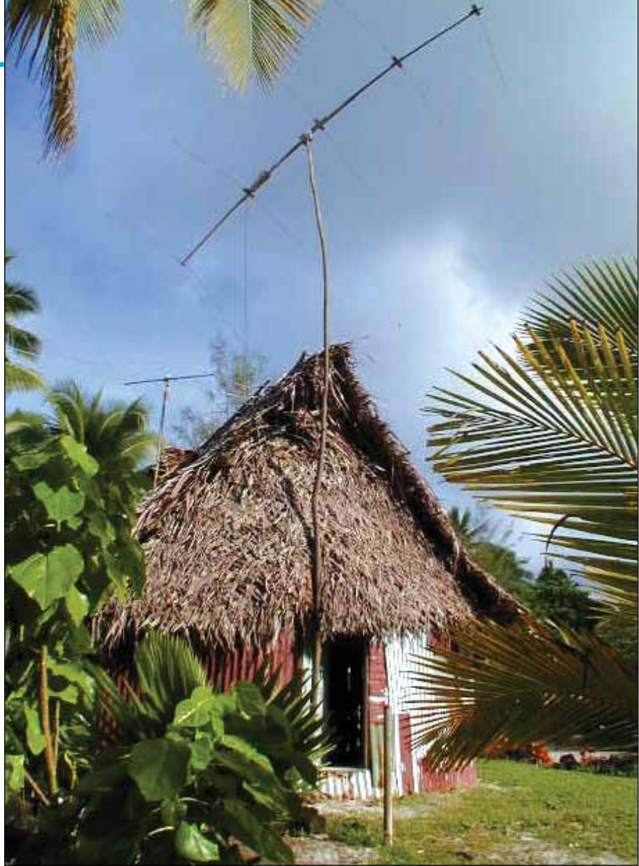
Fig. 5: Not exactly the neatest looking antenna system but the homebrew Yagi and mast (seen here by the 'shack') brought some remarkable contacts. The 10m beam can also be seen behind the shack.

Initial testing of the resonance showed a very acceptable SWR better than 1.3:1 on 50.110MHz, which meant that I could call CQ using 100W without any worry,