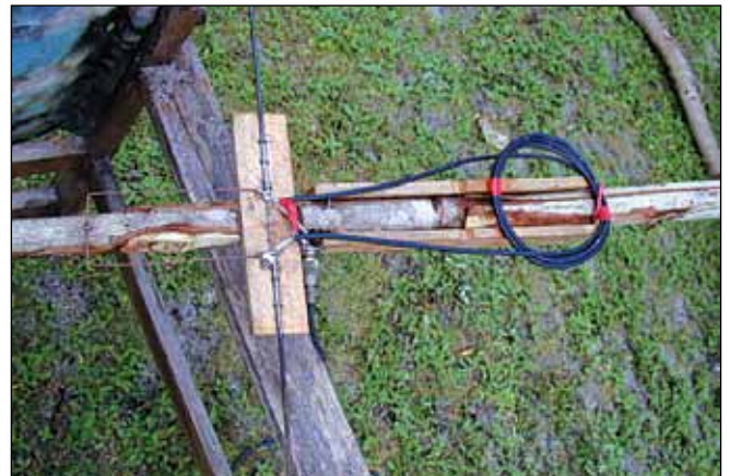
Fig. 4: The U-shaped hairpin matching system, along with coaxial phasing line.

about the house. Now this material is quite difficult to work with, being about 3mm in diameter, springy and not very rigid. I proceeded to straighten the lengths of wire as well as I could with a hammer and having measured them precisely as per the invaluable Antenna Handbook specifications for the 50.000 to 51.000MHz portion of the band, cut the director, reflector and driven element pieces with a pair of large pliers. The steel wire had been