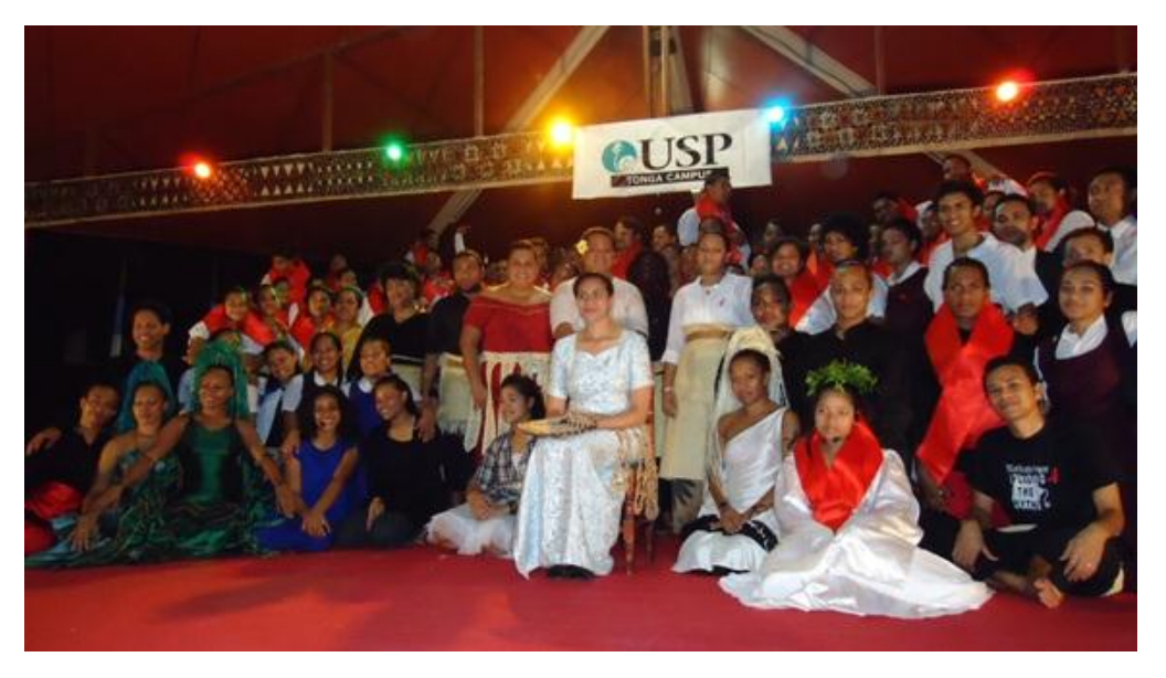
Princess Fatafehi 'o Lapaha Tuita' with the cast and crew of 'A Love for Life', Tonga 2010.

As part of its 2010 Tonga Outreach program in collaboration with the Kava Kuo Heka 2010, OCACPS focused on the use of the arts as an advocacy tool and included skills for life workshops in the arts including basic skills in dance, music and poetry. The climax of the Tonga outreach was the re-staging of "Silence and HIV: A Love for Life" supported in part by the UNAIDS, UNFPA, USP, SPC and PCC as well as local sponsors from Fiji and Tonga. The stage production which featured actors and dancers from Fiji engaged over seventy secondary school students from Tonga High School and thirty students from the University of the South Pacific Tonga Campus. These students participated as actors and the bulk of whom comprised the backdrop choir.