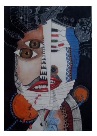
Split face of Moana Teweiariki Teaero, 2009.