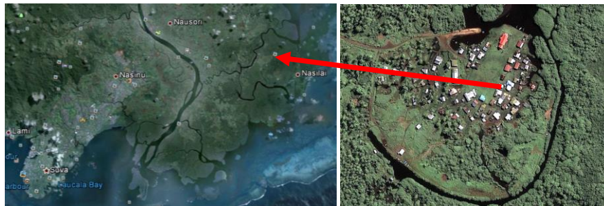
Figure 1. Location of Daku village

Daku village is located at about 30 kms north-east of central Suva and 3 kms from the open ocean at the end of one of the branches that branched off Rewa river as shown on Figure 1. The village is accessible to vehicles via gravel road. A bus service operates everyday starting from seven in the morning. There is one small retail shop that provides the daily needs of the community including bread. There is also a primary school, a church and community hall.