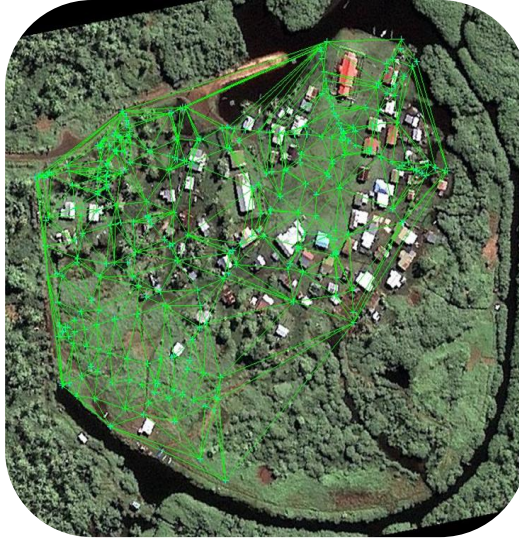
Figure 5. TIN meshes for Daku village

The data, as collected in the field, were downloaded from the Total Station to a Desktop computer using the Trimble Data Transfer software as an Excel spread sheet comprising Point ID, x-coordinate, y- coordinate, z-coordinate and the feature code. The data was edited, re-formatted and processed using version 8 of the 12d Civil Engineering, Water Engineering and Land Surveying software. 12d uses the data to create a Triangulated Irregular Networks (TIN) meshes from raw XYZ data as shown in the diagram of Figure 5.