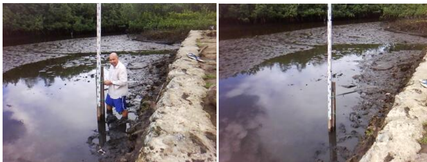
Figure 3. USP staff establishing a temporary tide gauge at the project site

A temporary tide gauge was installed, as shown in pictures of Figure 3, to check the referenced level or height datum provided by the Department of Drainage & Irrigation (DDI).