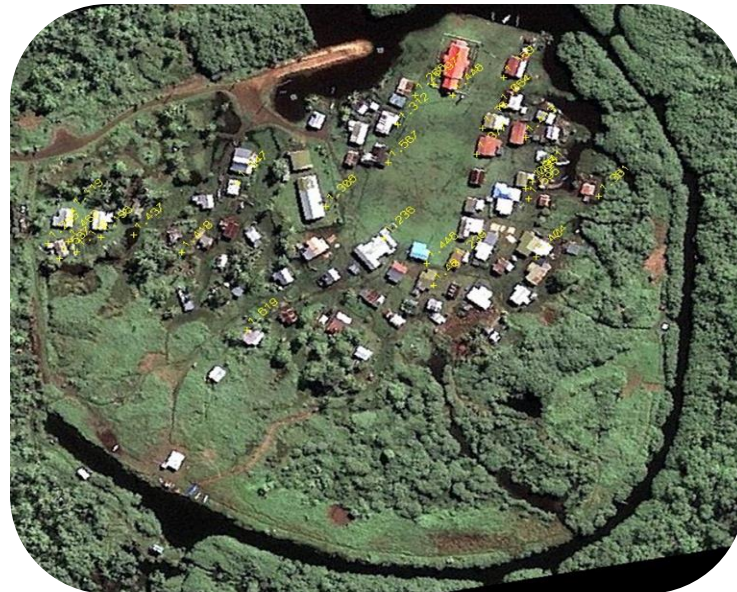
Figure 4. Floor level of some of the houses in the village.

Spot heights were taken at selected location, especially where there is a change of grade. The spot heights ranged from -0.203 m (below mean sea level) at the lowest spot to +1.443 m (above mean sea level) at the highest location. The survey reveals that some parts of the village are below mean sea level and a large part is below sea level at highest high tide.