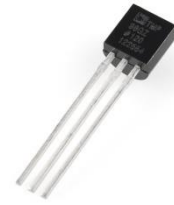
Figure 4: Temperature sensor

A sensor to measure the ambient temperature [4]. Coupled with the smoke detector, this will assist in determining whether a fire incident is underway.