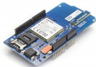
Figure 5: GSM Shield for Arduino

If design goes into production, its cost can be significantly reduced by using special purpose GSM chips instead of this expensive shield.