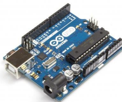
Figure 6: Arduino Uno – microcontroller