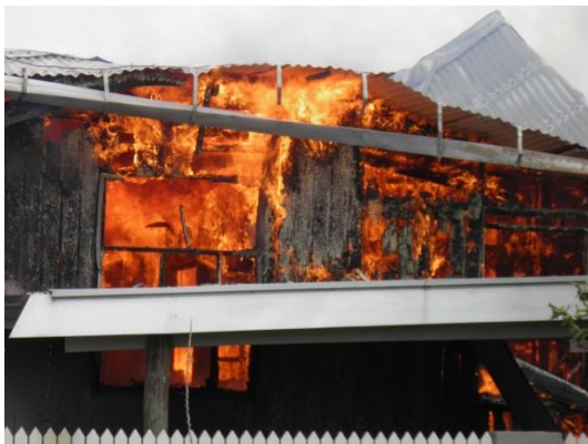
Figure 1: A recent property fire incident in Suva

Can we reduce the number of fire incidents at home and office in the Pacific region using an affordable technological solution?