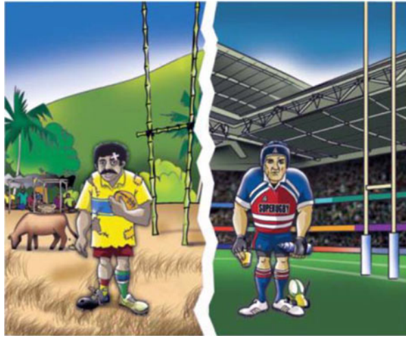
Figure 1. Cover picture of Narsey's To Level the Playing Fields .

Many players thus devote all their time and energy – and thereby sacrificing education, vocational training, employment and standard of living – to their rugby-focused quest, with little or no institutional support along the way. One of the key consequences of this type of player development is that many players are left without employable skills/qualification or essential knowledge/skills relating to financial management, health and safety, or career development, which impacts critically on their own career management and post-career livelihood capacities. It is on the basis of such high level of sacrifice of masses of athletes that Fiji produces its outstanding elite players.