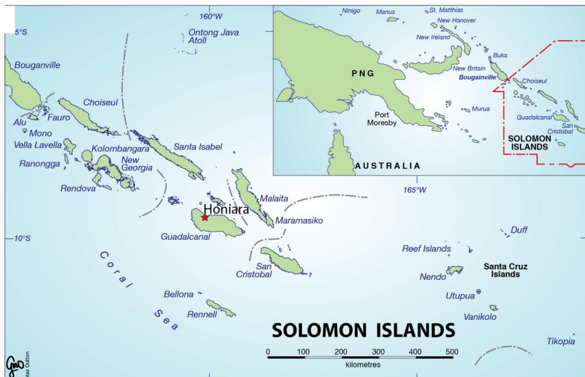
Figure 1: The Solomon Islands

With just 0.8 percent of its global natal population living overseas, the Solomon Islands (Figure 1), a Pacific archipelago, ranks 138th in the world for diaspora formation as a proportion of population: a total of less than 4500 persons within a population just under 600,000 in 213 (Bedford et al. 2014). At these levels, the scale of the diaspora as a proportion of population remains much lower than it was in the early 20th century, when 5,000 Solomon Islanders living and working in Queensland were compulsorily repatriated under early 'White Australia' legislation (Corris 1972). Compared to island states in the northern and eastern Pacific, the small diaspora is exceptional when compared with over 50% of Samoans and 85% of Cook Islanders living offshore (Lilomaiva-Doktor 2009, Cook Islands Government 2012).