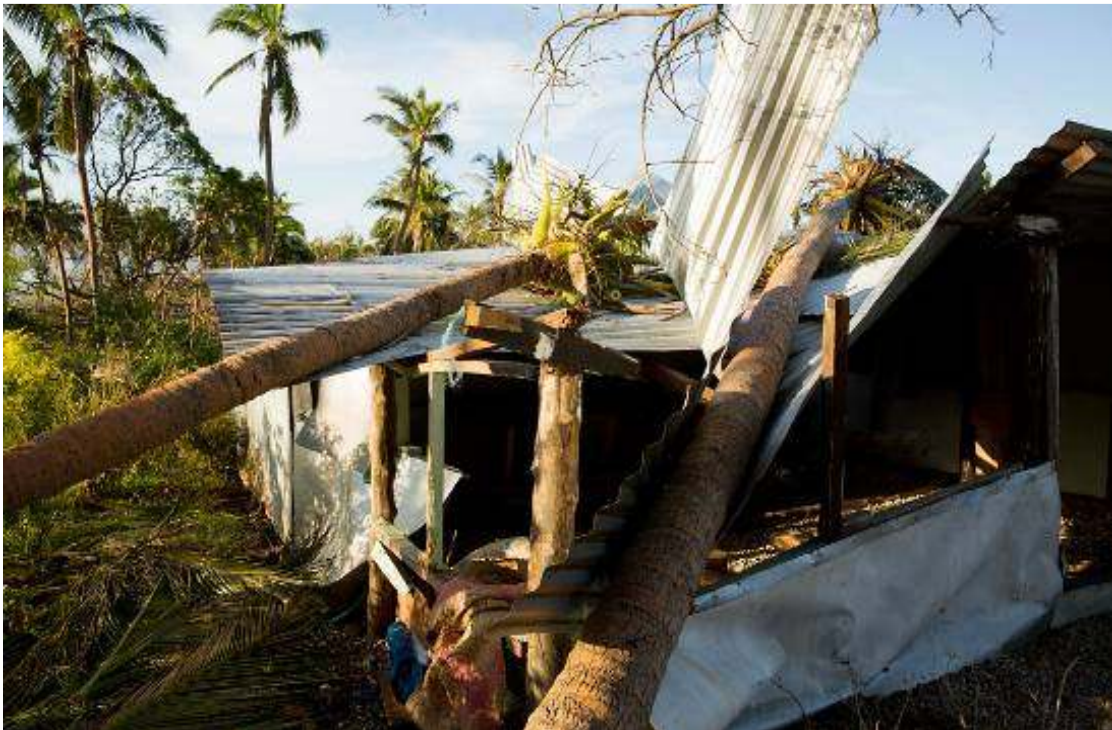
Fig. 3. A community collection center being damaged by the cyclone PAM

of the monstrous cyclone. It was a common picture around these countries where many of the houses were left without roof (Fig. 4). Especially areas which were on the hill tops like Erkor mountain suffered the most. Alternative water source from the rivers in absence of harvested rainwater was hampered by the intrusion of salt water from the nearby lagoons. In many places the roofs and channels were seen flowing through the overflowing rivers. The recovery was poor as of the plastic being done to bit and pieces due to the flow rate. Most of the bays were seen heaped with the roofing material, channels and torn plastic tanks of the harvested systems. It was pathetic that neither the collection systems nor the utensils were left, though there was sufficient rain for days after the cyclone. They were forced against their culture to have the bottled water but, they had for the mere survival. In view of these cultural jinxes all over the world Hay and Nobuo felt that, development can be made more sustainable by increasing the ability of systems and societies to adapt to multiple stresses, including climate change [21]. It was reported by Vohland and Barry that rainwater harvesting supported sustainability in the sub-Saharan Africa which has been facing climate change impacts [22].