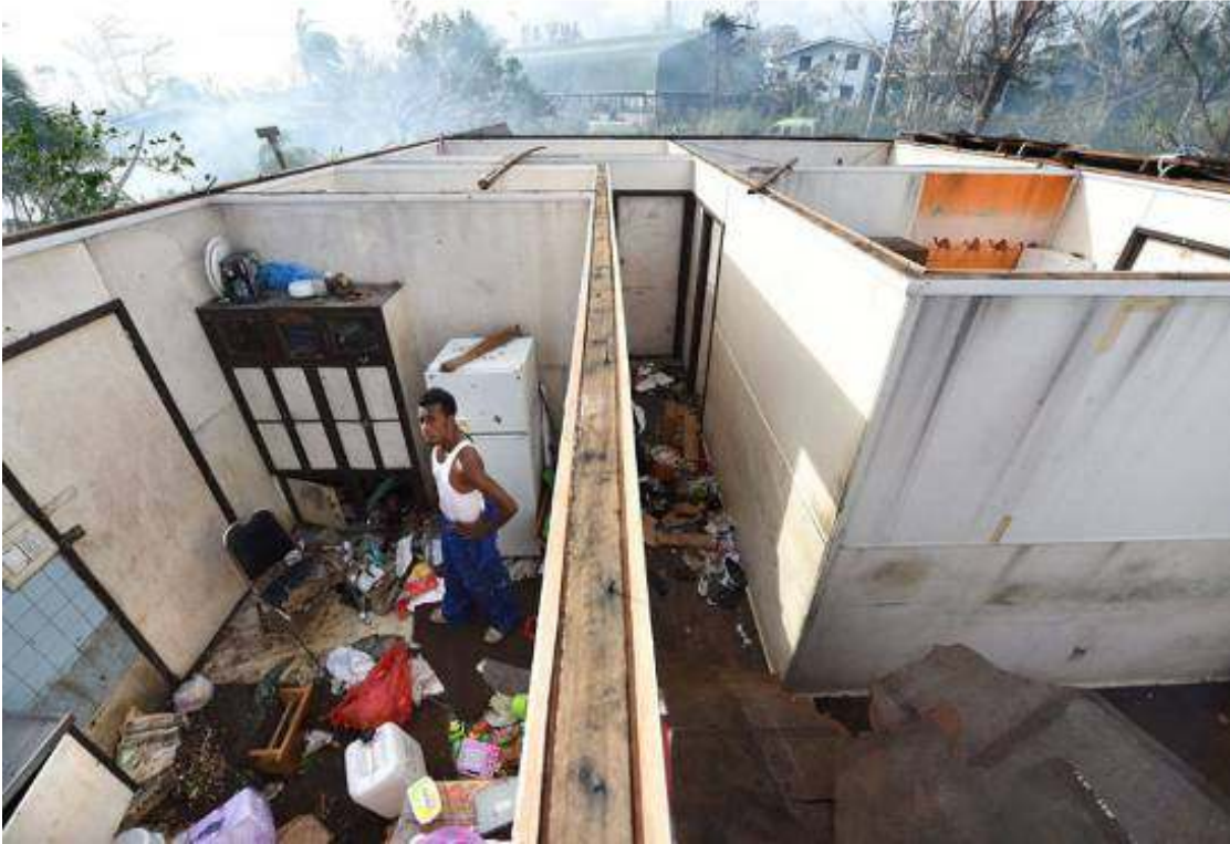
Fig. 4. Roof for the collection of rainwater being blown by the cyclone PAM

It was reported that most of the Islands were flooded by the overflowing local rivers which intensified the damage to the supporting structures of the harvested systems. Being predominant volcanic formations with rich calcium carbonate deposits, the flood water weakened the structures by dissolving the crumbled bases due to the strong winds. Earlier it was a debate in sealing the bases of the rainwater harvesting systems to be sealed with cement base but, in most places the local practice of direct eruptions from the land are preferred. May be the idea would had saved many from the cyclone impact besides protection from the termite attack as well. It was learned that reasons behind the opposition was the thought that the mixing of other ingredients into the land would bring harm and as well spoil the fertility of the nearby areas as well. It seems that the idea had its advantages and concerns but, at the same time need more studies in finding the facts. Even the use of covering for the wooden bases with polyethylene or rubber sheets was not being practiced in many areas as they were against the custom practices. Sometimes the extra support from the cross fixing with other stands has been commendable and a sustainable practice being followed in other parts