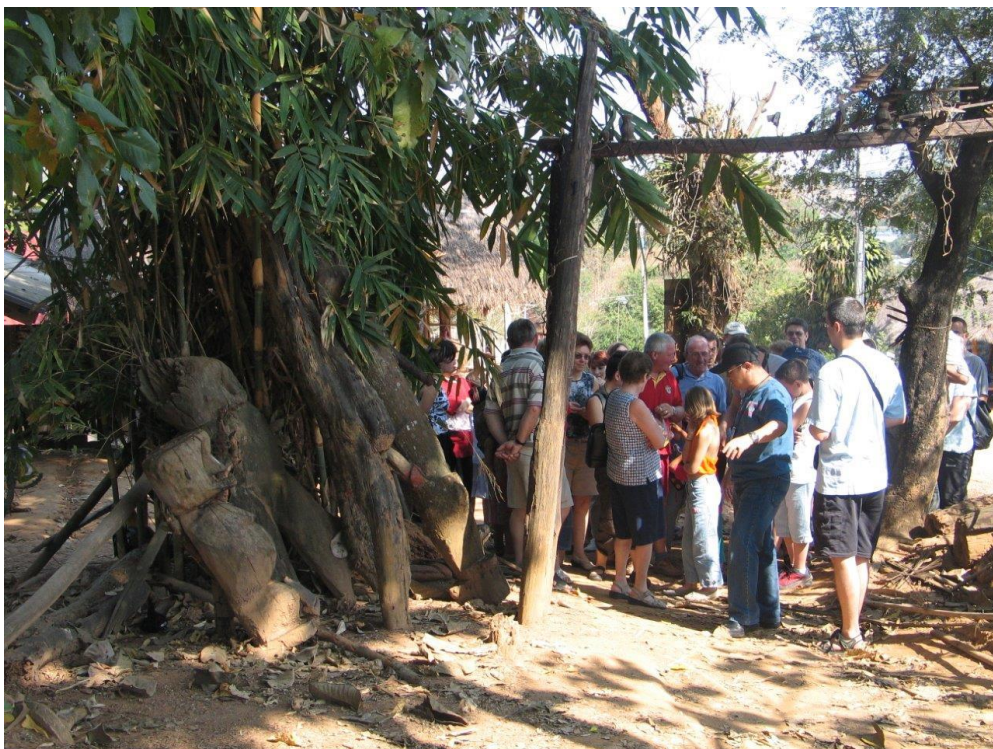
Plate 3: Tour group at the entrance gate

are handmade, but for the most part ordered from companies in Chiang Rai, Chiang Mai, or in Tachilek (Burma/Myanmar). The main attraction are the exotic Akha themselves, in particular the women, who wear imposing head decorations. Akha-specific “cultural goods” and tourist attractions such as the village gates and guard statues at the entrance of the village or the nearby swing, (only used during the Swing Ceremony) can be seen as objectified cultural capital (Bourdieu 1986).